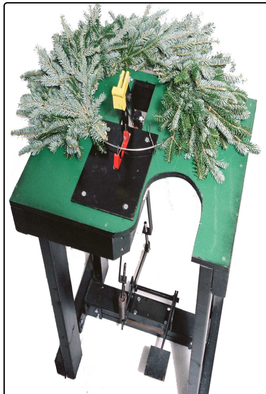
WreathMaster with Table

The WreathMaster eliminates the need for hammering clamps from the top after you have closed them. It reduces the time needed for manufacturing wreaths and results in a very tight finished product. Put up to 20% more greens in a standard clamp ring. ( especially useful when wreaths are made earlier (shrinkage) or for large rings that need a wider face).